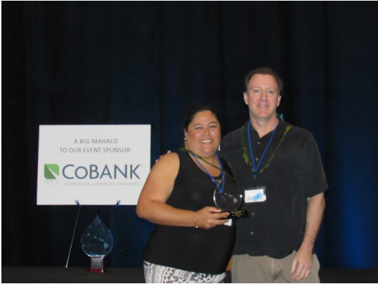
Hawaii best water competition. KPHA runner up