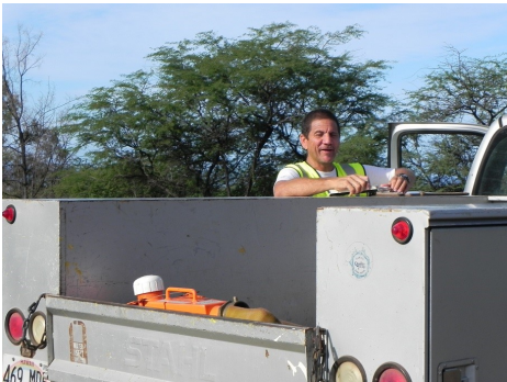
Verifying clean water.