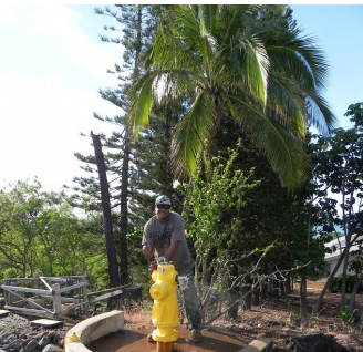
Koa, setting up hydrant for flushing.