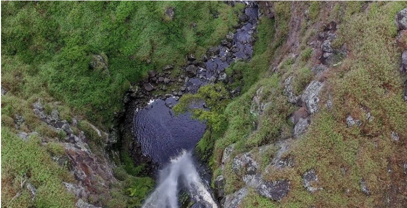
Photo: Kawela Gulch

Kawela Plantation is one of 15 partners, of the East Molokai Watershed Partnership (EMoWP) that protects over 30,000 acres of watershed, including much of north and central Molokai, extending east until the ahupua‘a of Pu‘u ‘O Hoku. The EMoWP has developed strategies in an effort to protect Molokai’s hydrological resources and native mauka forests. The health of our mauka watersheds has declined significantly over the last century. The degradation of these watersheds is largely attributable to an influx of habitat altering invasive plant and animal species that have quietly but significantly impacted native forests, the life that inhabits them, and the freshwater they foster.