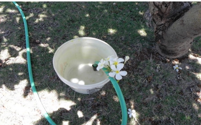
All lots with water in Kawela Plantation Homeowners Assn. have backflow preventers (BFPs). These BFPs are tested and repaired annually.

It is easy to protect your water supply from these hazards. Be aware of potential hazards and install appropriate backflow preventers at water outlets.