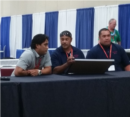
2016 Top ops competition winners

I leave you with this Chinese Proverb “When you drink the water, remember the spring”