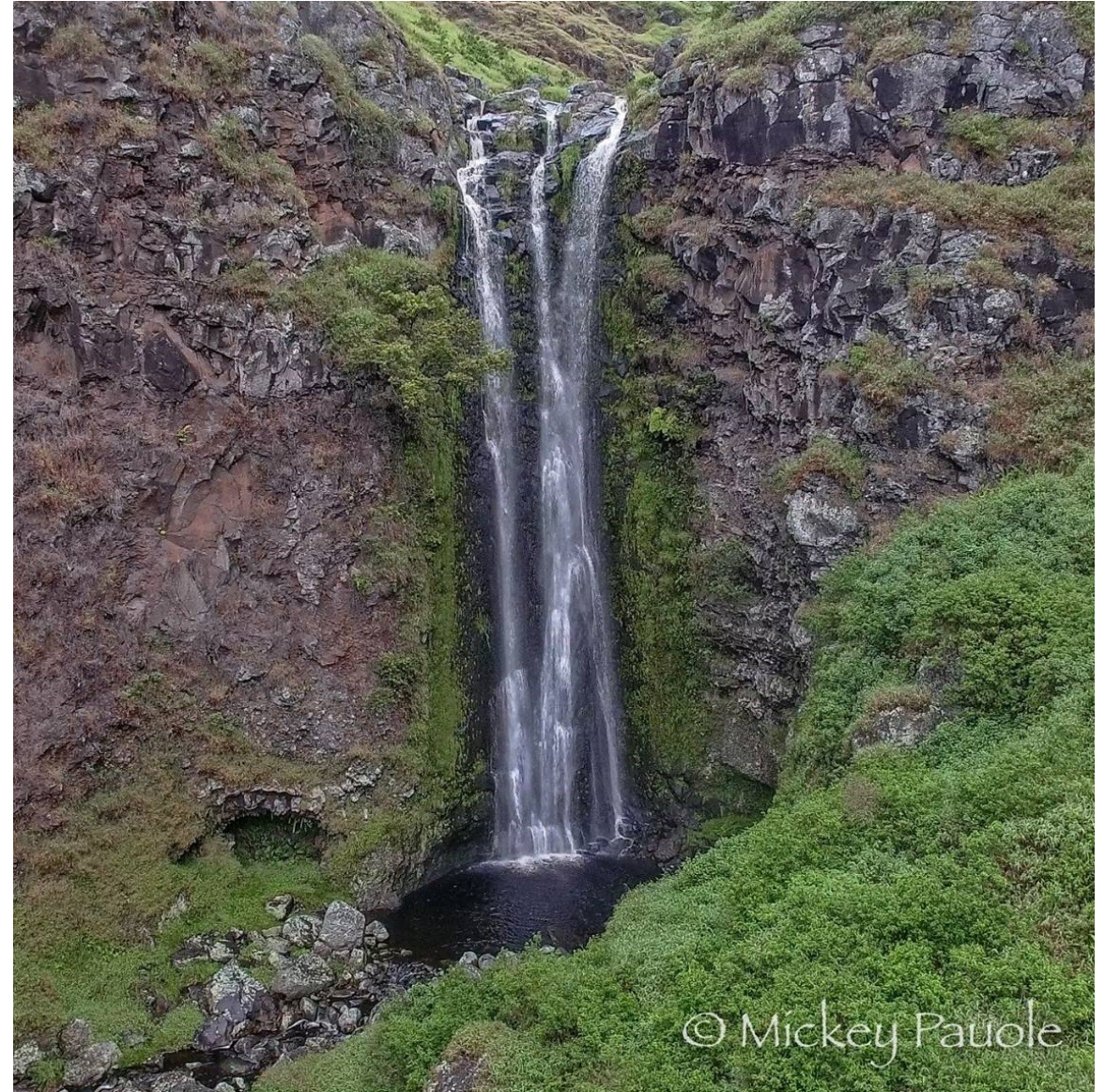
PHOTO: of East Kawela Gulch

KAWELA PLANTATION HOMEOWNERS ASSOCIATION P.O. Box 28 Kaunakakai, Molokai, HI 96748