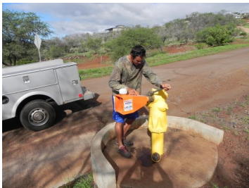
Troy setting up diffuser to Hydrant and then showing why we do Annual flushing of KPHA-Water System

Flushing of the water distribution system is performed every year primarily to remove sediment in pipes. These sediments, which do not pose a health concern, are comprised mostly of minerals which have accumulated over time in the pipes. An annual flushing program helps to keep fresh and clear water throughout the distribution system.